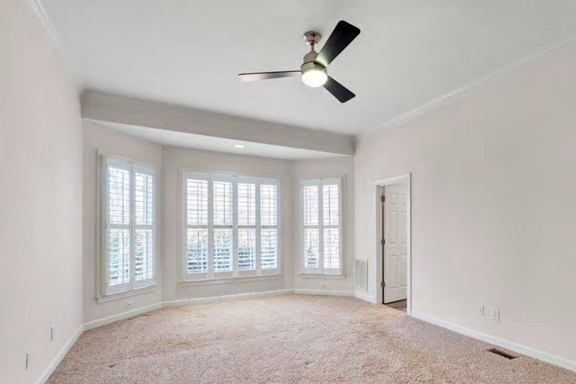
MAIN-LEVEL PRIMARY BEDROOM SUITE BATHROOM WALK-IN CLOSET