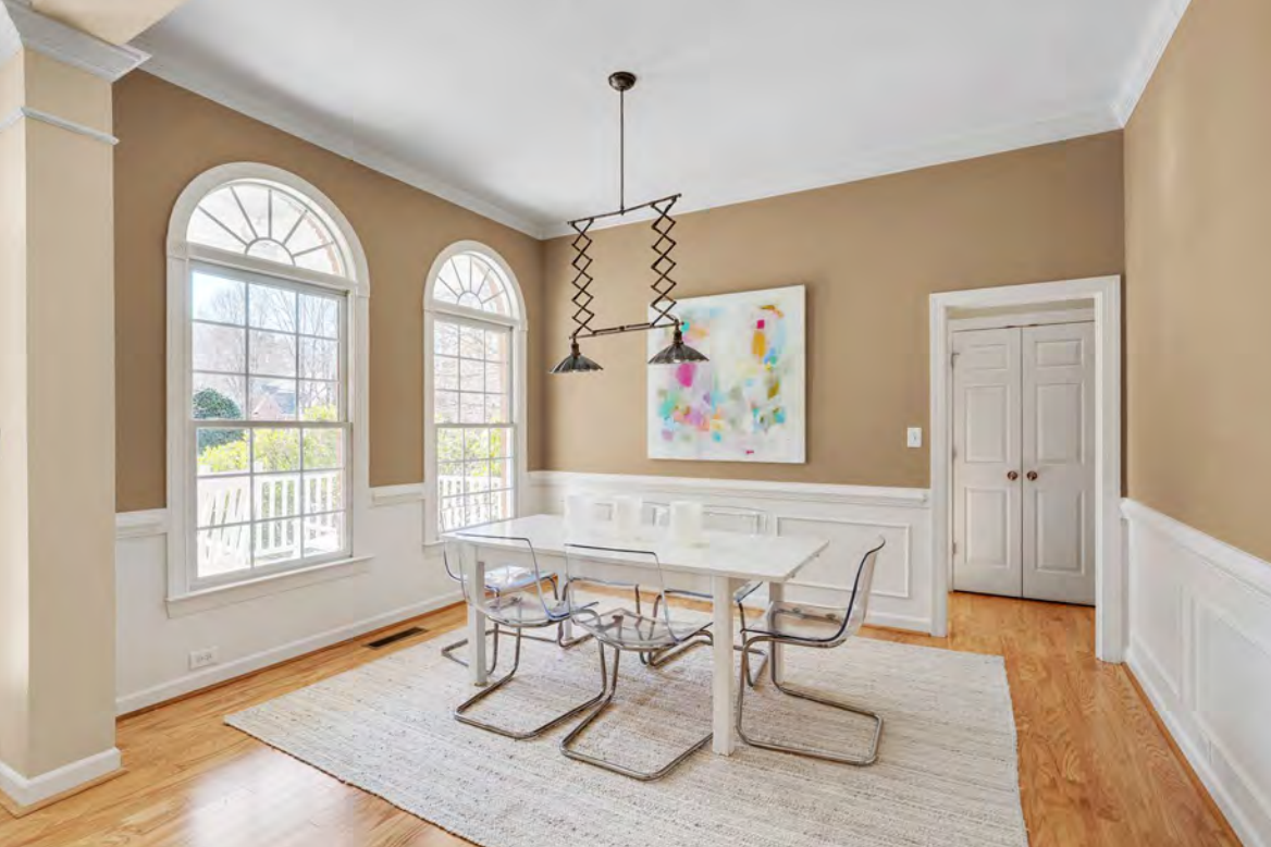
DINING KITCHEN FAMILY